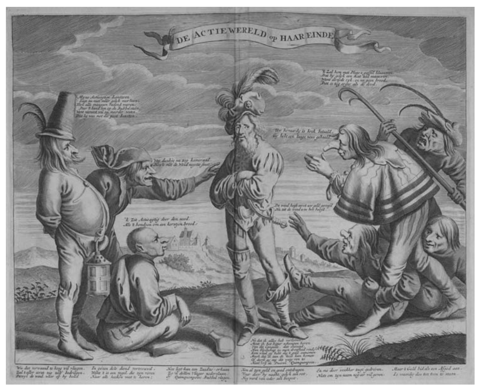
FIGURE 4. The End of the Stock World