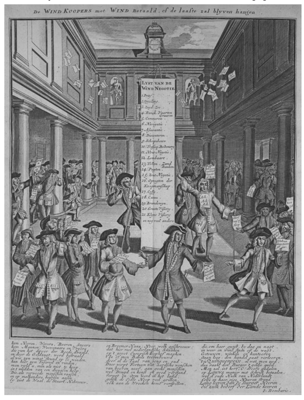
FIGURE 3. The Wind Buyers Paid in Wind, or Those Who Are Last Will Remain Hanging on