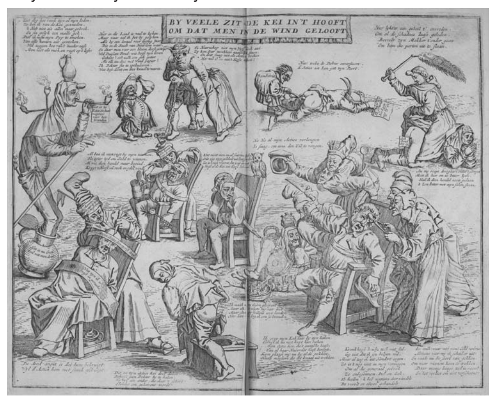
FIGURE 2. Many Became Crazy Because They Believed in Schemes