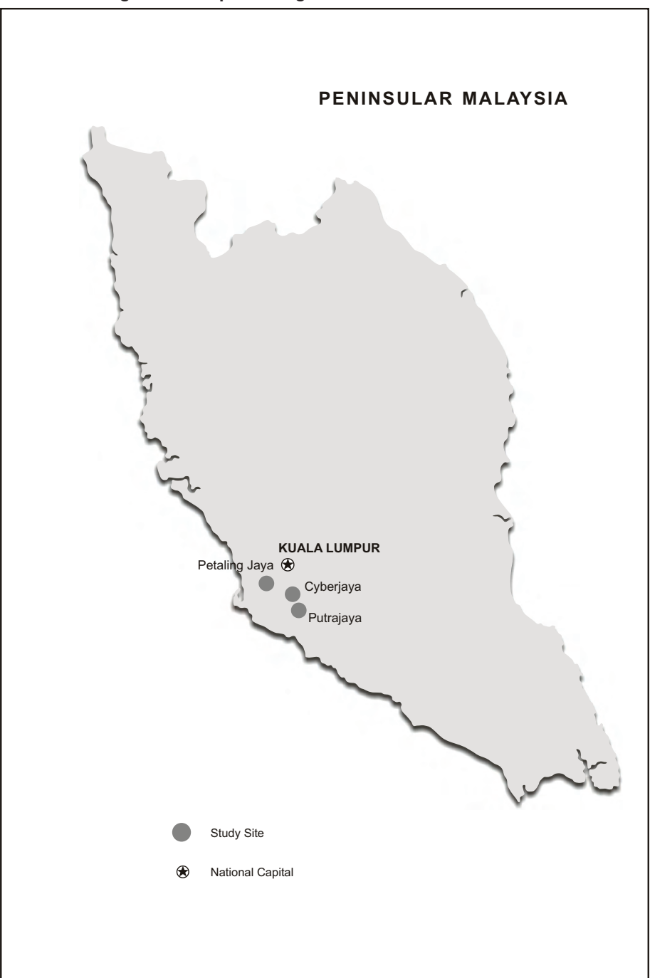
Figure 9.2: Map Showing Location of the Case Studies