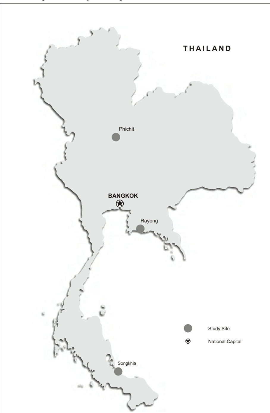
Figure 13.2: Map Showing the Location of the Case Studies