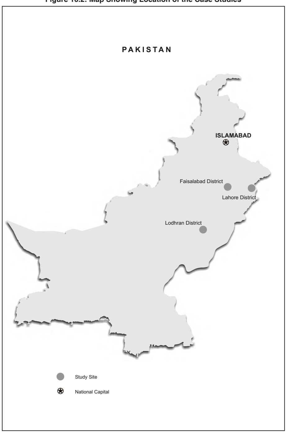
Figure 10.2: Map Showing Location of the Case Studies