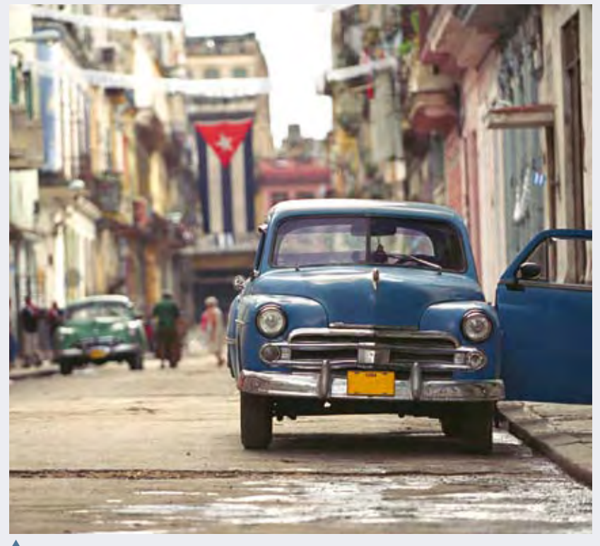
Havana, Cuba

Owing to the Cuban government's social policies, human settlements in the country have developed over time into a spatially balanced network: 593 urban settlements are home to more than 8.5 million (76 per cent) of Cuba's inhabitants; another 2.7 million people live in some 6,500 rural settlements, and only 835,000 (7 per cent) live outside such structures. Twelve provincial capitals are home to a significant proportion of industrial enterprises and account for a high percentage of employment in the administrative and service sectors. These cities are able to provide top-quality services and act as development centres for their respective regions. Another 142 administrative centres of various sizes cover a territory of about 670 square kilometres and act as intermediate service centres. Smaller urban and rural settlements that have no political or administrative functions have acquired the necessary infrastructure to provide basic ser-