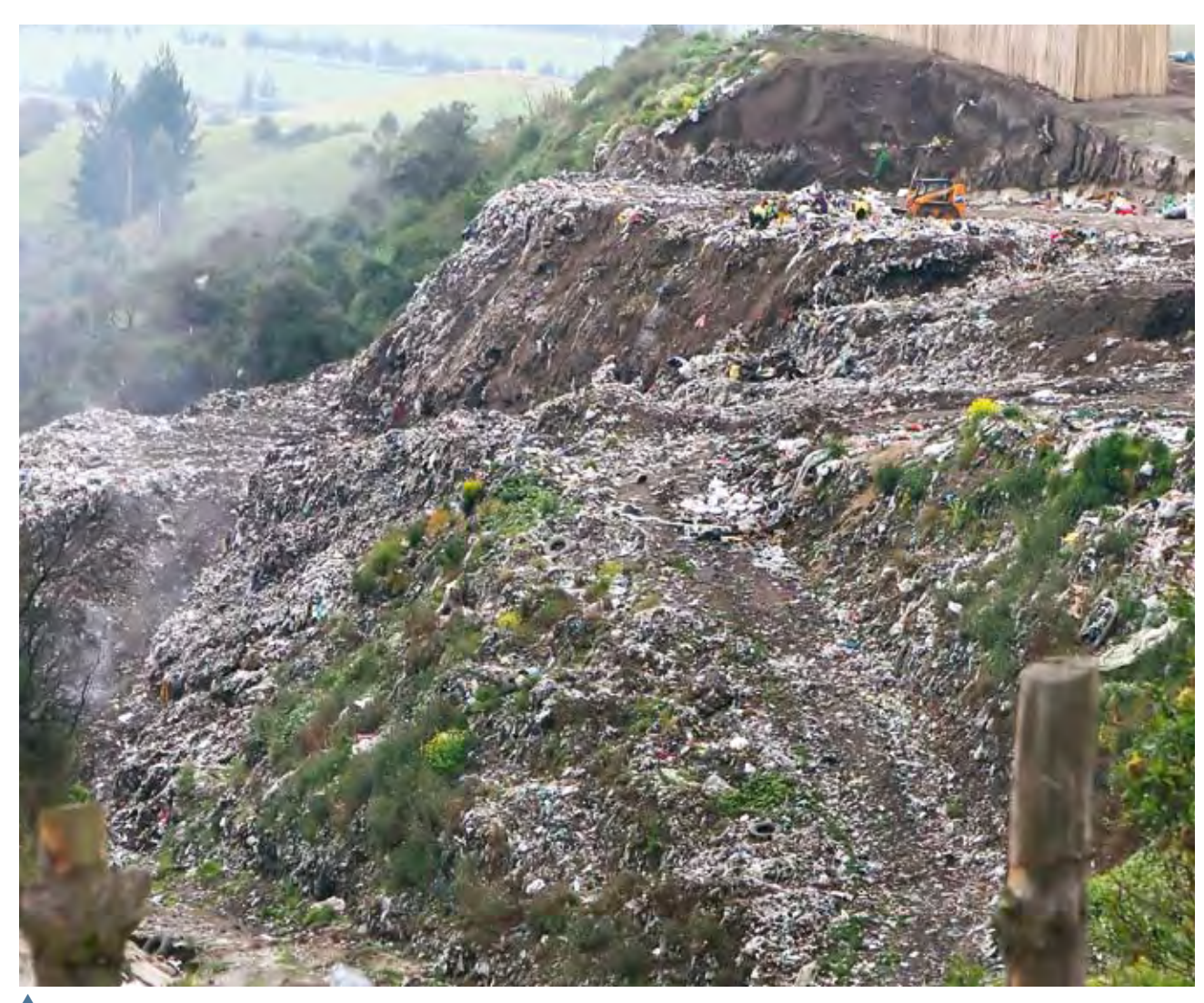
Garbage dump in South America

Land in the rural-urban interface is often under intensive pressure, owing to processes of use conversion and commercialization. These are not only the result of urban sprawl, but also of the loss of farming land in rural areas because of "de-agrarianisation" or even to the abandonment of customary practices of land occupation, as illustrated by several studies in East and West Africa.<sup>28</sup> Other factors include immigration of the poor from rural areas; the urban poor moving towards the outskirts where rents and land prices are lower; the better-off building new houses in less-congested areas; loss of agricultural land because of expansion of the city