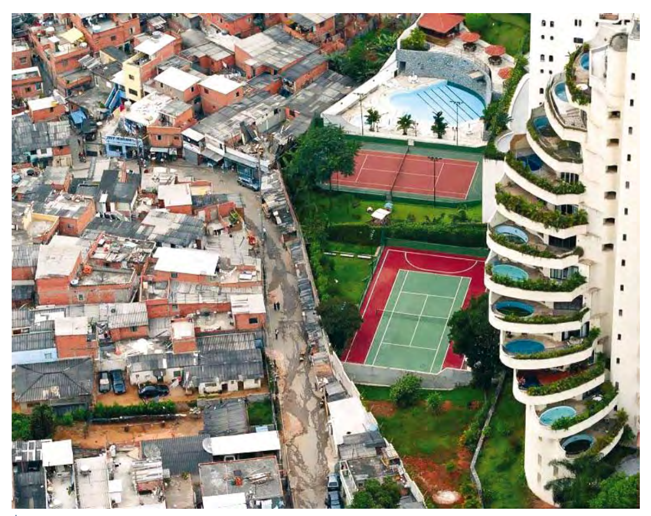
Low- and high-income housing in São Paulo.

Strategies that work not only improve the physical living conditions of slum dwellers, but they also preserve nontangible assets, such as sense of place, sense of belonging and culture of mutual solidarity. Such strategies improve existing slums without disturbing social ties and create conditions to prevent the formation of slums of the future.