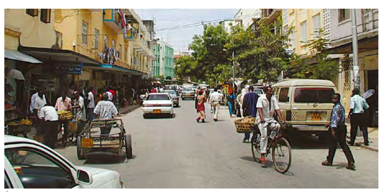
City street in Mombasa, Kenya.

Once governments have tried and tested pilot or preliminary interventions, they need to document, define and refine successful approaches. Countries that are doing well