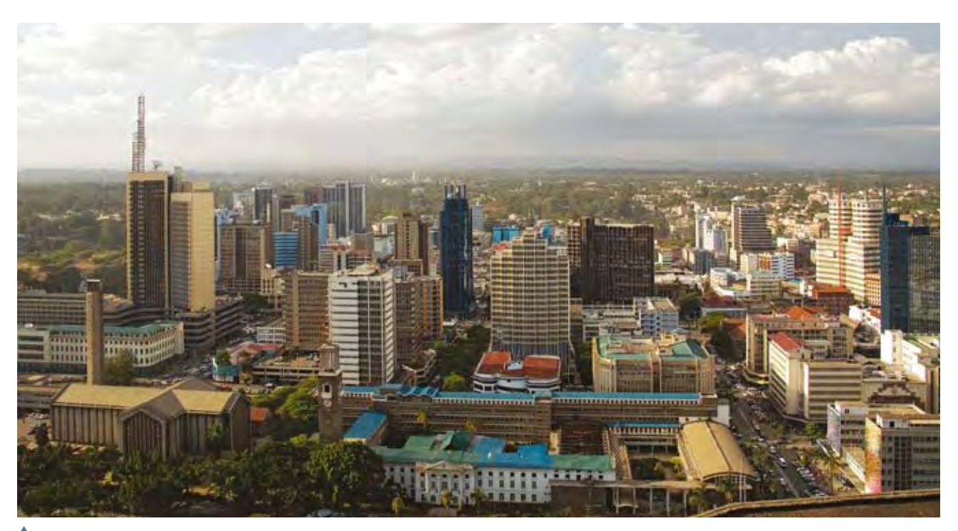
Nairobi skyline

participate in programmes are factors in determining access to government subsidies for new housing or house improvements. This approach has been adopted in Cuba, for instance, where a new focus on community involvement in the planning, preservation and rehabilitation of homes has developed, and where reliance on volunteers and self-help housing rather than on state-led construction is becoming more common.