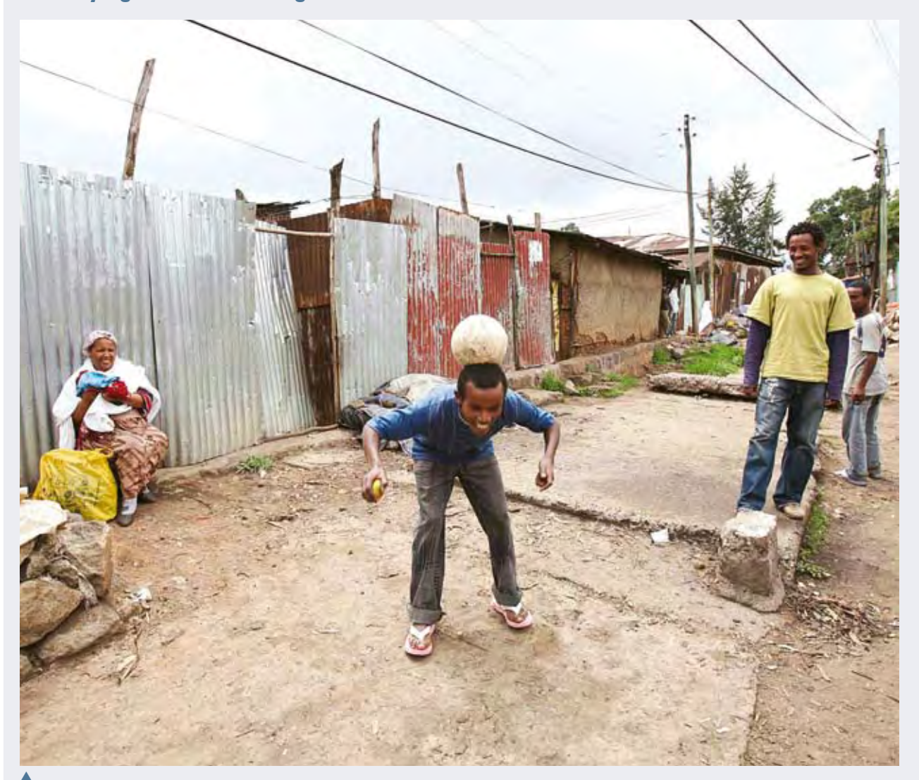
Boys play football in one of the suburbs in Addis Ababa, Ethiopia.

UN-HABITAT conducted its first Urban Inequities Survey (UIS) in Addis Ababa, Ethiopia, in 2004. The survey, carried out in collaboration with Ethiopia's National Statistical Office and the Municipality of Addis Ababa, was administered to 1,500 households with the goal of understanding how, on a socio-economic level, people living in the city's slums and its planned neighbourhoods experience the city differently.