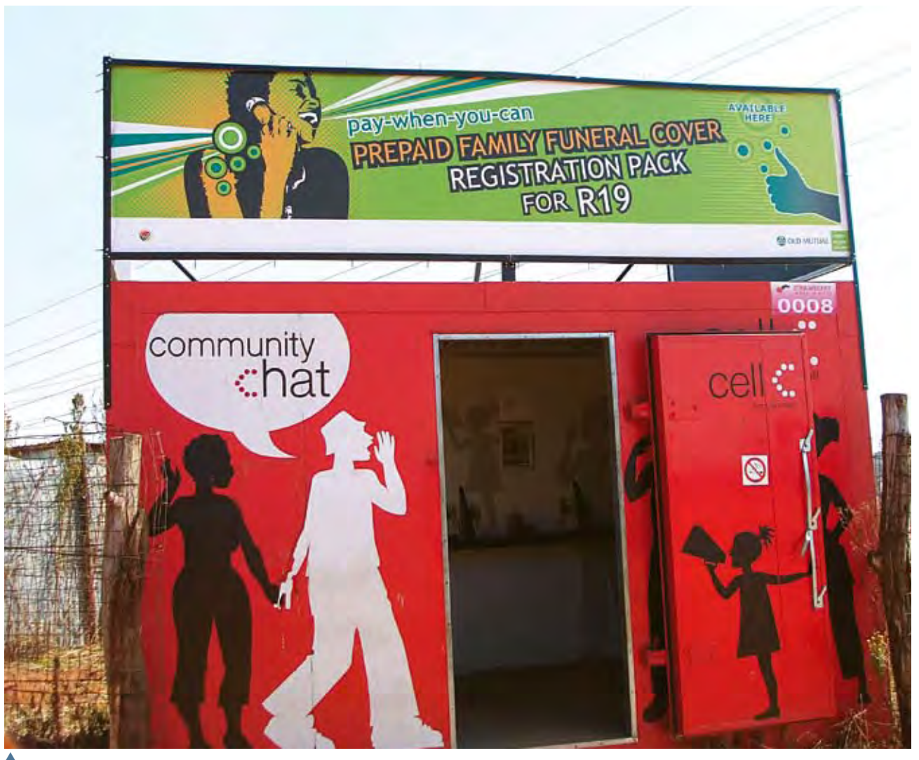
an insurance booth in South Africa: Funeral societies and savings groups in low-income settlements can be the source of transfers in cash or kind in case of emergency.

already have access to resource allocation decisions of the state or the private sector are much more likely to exclude other groups from powerful networks, much as membership in exclusive clubs or associations restricts the benefits of social capital to a particular group of individuals. If social capital is formed around ethnic identities, it may also serve to polarize societies where ethnicity has been politicized, as evident in many conflict-ridden African countries in recent years. In these cases, decisions by powerful groups serve to reinforce exclusion rather than to foster inclusion and equal treatment of others. When powerful groups use their social networks to practise corruption and cronyism, social capital can actually be detrimental to society. In some countries, resource control by powerful social networks prevents economic growth from translating into greater equality.<sup>20</sup> The challenge is to understand how social capital operates under different circumstances so that negative consequences can be minimized.