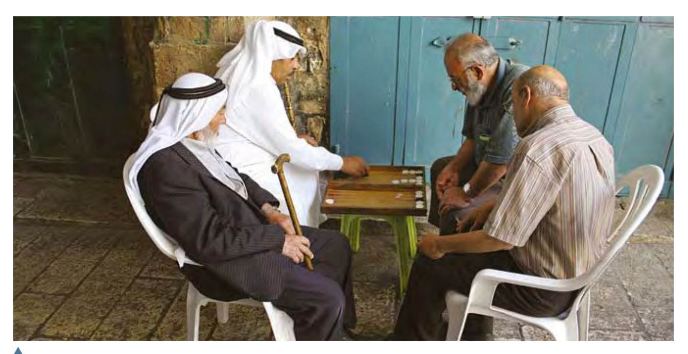
Arab men playing backgammon, Old city, Jerusalem, Israel

n recent years, increasing attention has been paid to the question of whether the absence of social networks, or what is known as "social capital", is affecting the quality of life in cities. Indeed, a great paradox of big cities is that proximity and high densities do not necessarily provide for strong social ties and networks. It is the very freedom, privacy and anonymity offered by city life, in fact, that weaken "social capital" – the networks of civic engagement that facilitate cooperation and mutual benefit in society.