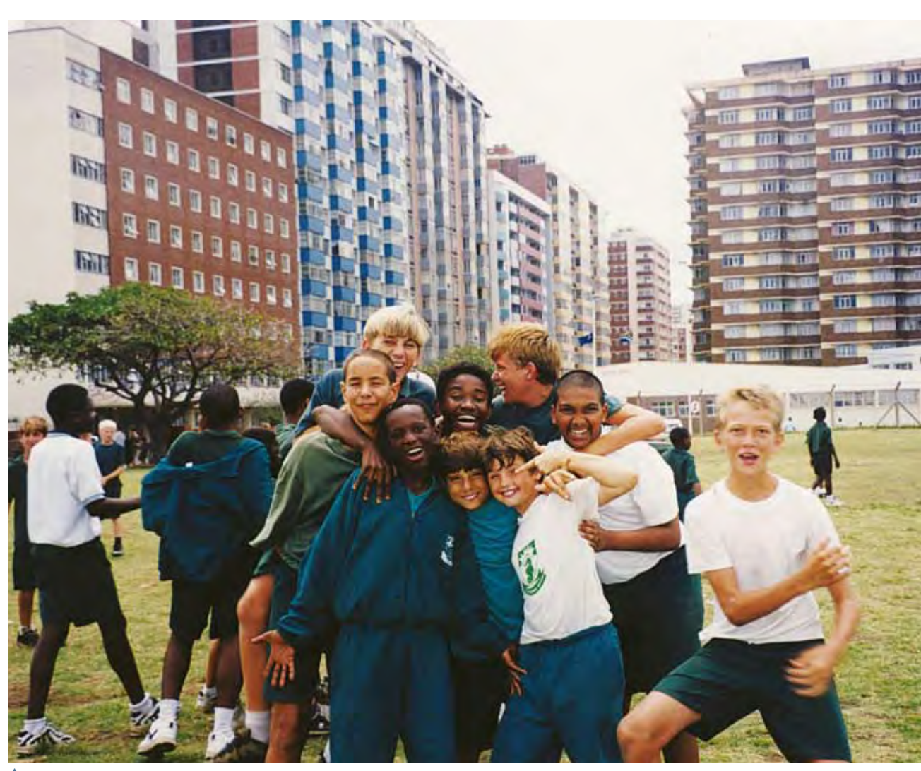
School children in Durban, South Africa.

Strengthening of social capital has become one of the three pillars of programme interventions in developing countries, along with the strengthening of financial and human capital. Social cohesion – the potential of individuals to engage in the wider social, political, economic, and cultural environment has also been seen as a key component of democracy, national development and social transformation. Development agencies have become more aware, too, that the presence of strong social networks can have a positive impact on governance institutions, and that knowledge and information can mitigate risk and improve the livelihoods of the poor. Not knowing about their rights, services they could access, plans for their areas or options available for tackling certain problems puts the poor at a disadvantage and increases their vulnerability. Providing access to traditional and new media, therefore, may reduce the vulnerability of populations in many countries.