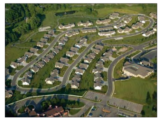
Urban planning is a significant management tool for dealing with the challenges facing 21st century cities

This Report views urban planning as a significant management tool for dealing with the sustainable urbanization challenges facing 21st century cities. While the forces impacting on the growth of cities have changed dramatically in many parts of the world, planning systems have changed very little and contribute to urban problems. This does not need to be the case: planning systems can be changed so that they are able to function as effective instruments of sustainable urban change, that is, capable of making cities more environmentally sound and safe, more economically productive and more socially inclusive (see Box 1). Given the enormity of the issues facing urban areas, there is no longer time for complacency: planning systems need to be evaluated and if necessary revised.