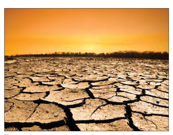
The most important environmental concern today is climate change