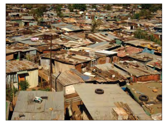
Urban poverty and the growth of slums have refocused attention on planning

The global urban transition witnessed over the last three