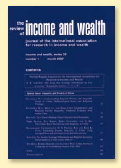
The Review of Income and Wealth