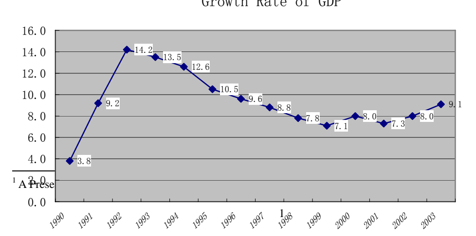
Growth Rate of GDP